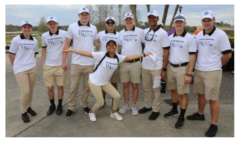
Cadets from the University of Central Florida pose for a picture in their AFA Wounded Airman t-shirts.