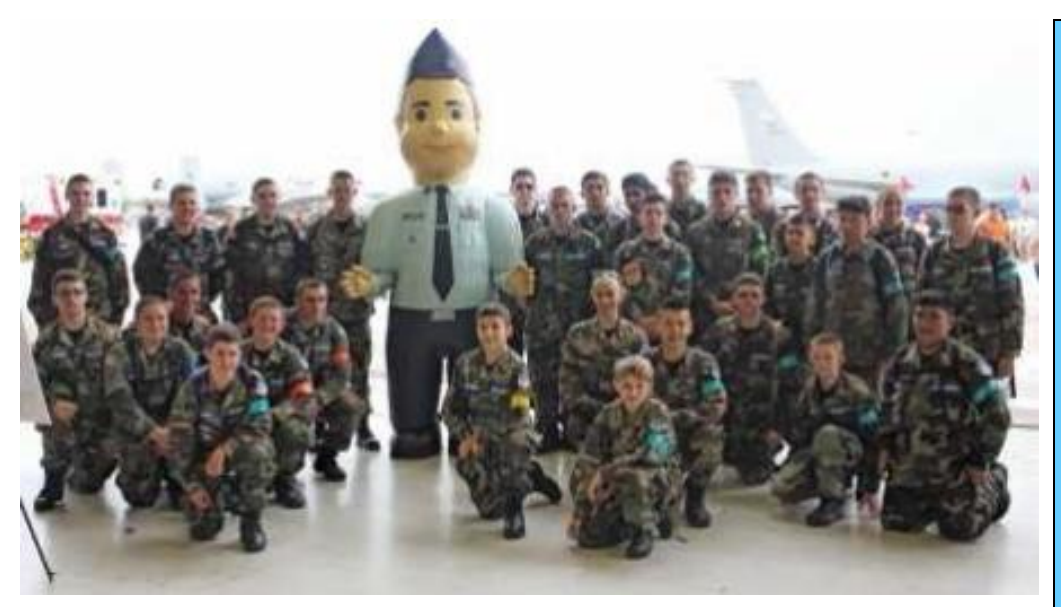
The General Chuck Yeager Civil Air Patrol Cadet Squadron at MacDill AFB.